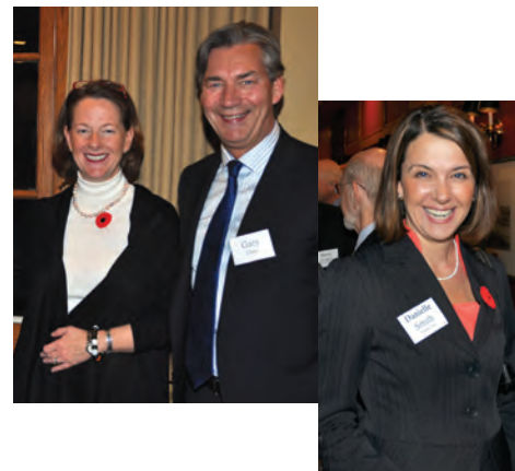
Former Manitoba Premier and current Canadian ambassador to the United States, Gary Doer , spoke at a special policy dinner in Calgary in October 2011. Among the policy leaders in attendance were Alberta Premier Alison Redford (with Ambassador Doer) and Danielle Smith , leader of the Wildrose Alliance Party of Alberta. The event was sponsored by GE.