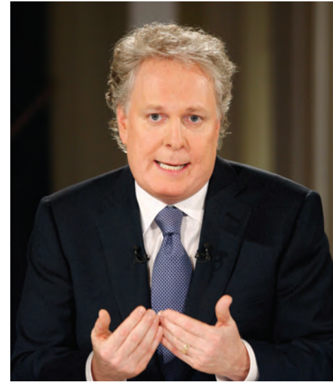
The Hon. Jean Charest , Premier of Québec, spoke at an Institute roundtable in Montreal on "Québec – At the Right Place, at the Right Time."

Over the course of 2012, fiscal pressures will weigh ever more heavily on Canadian governments, and their taxpayers. Shrewd analysis, and prudent policy, will be keenly needed.