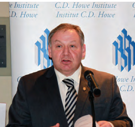
The Hon. Darrell Dexter , Premier of Nova Scotia, spoke at the Institute on "Atlantic Canada's Energy Future."