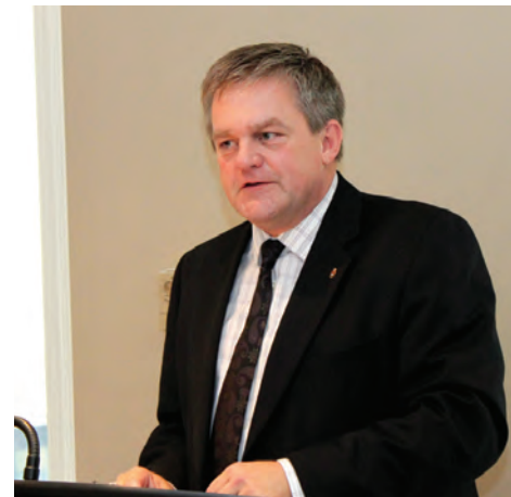
The Hon. David Alward , Premier of New Brunswick, spoke at an Institute roundtable on “growing innovation.”