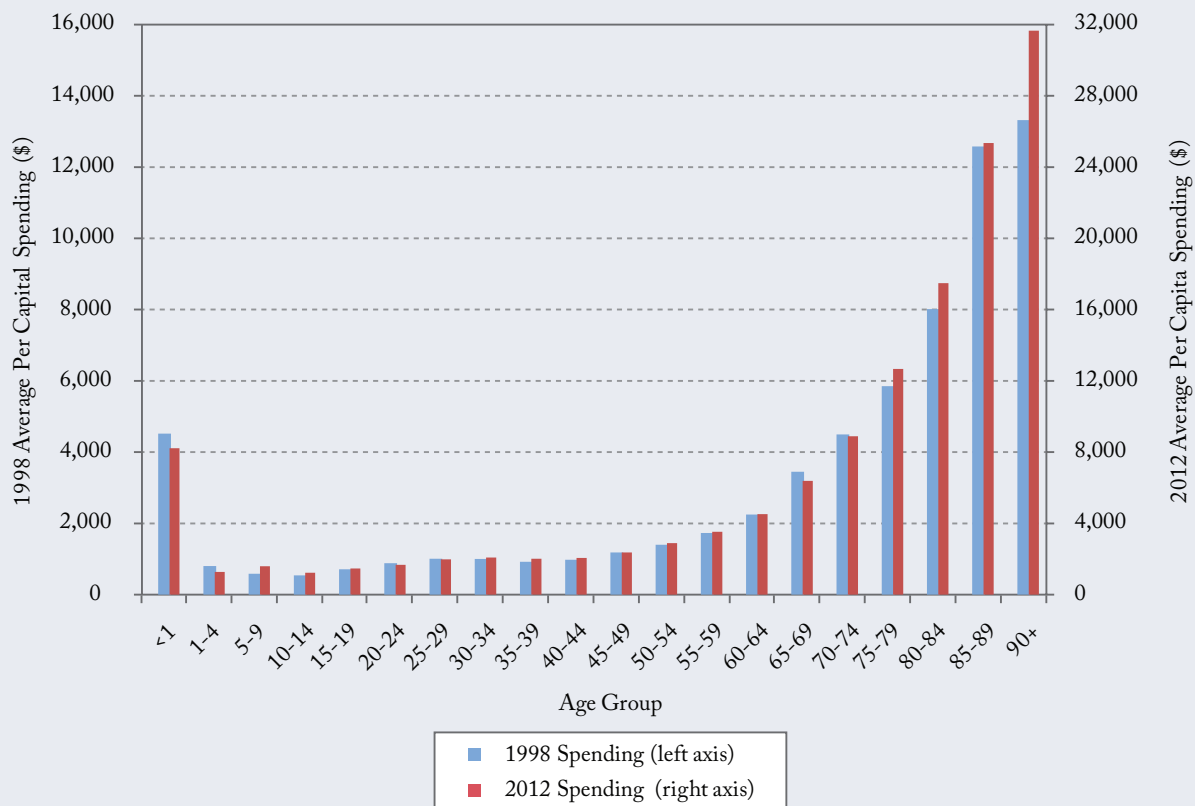
Figure 3: Average Per Capita Health Spending by Age Group in New Brunswick, 1998 and 2012

Note: The vertical axes show nominal dollars for transparency's sake: these are the actual dollar figures from CIHI. We could have used constant dollars from either – or, indeed, any year – or index numbers, because this focus of this figure is the relative distribution of health spending by age in the two years. To facilitate comparison of the age-profiles of spending: we have set the vertical scales so roughly half the bars in each year are taller (or shorter) than their counterparts in the other.