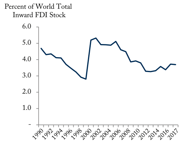
Figure 1: Share of World Total Inward FDI Stock, Going to Canada

Note: Canadian FDI stock is valued at constant 1992 USD/CAD exchange rate.